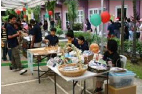
Rope Ring Game & Crafts Booth

It was a day to be recorded into the annuals of GFI Singapore. Despite the rain, an estimated 1,000 people joined the fun fair and boy was it fun. The children rose to the occasion with a wide range of games and crafts booths. A total of 23 games stalls were presented! The games booth concept is “by the children, for the children”.