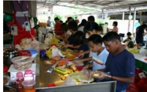
Of course mom needs help