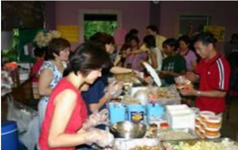
Moms hard at work

Food were plenty and sold fast. The GFI moms cooked up a storm, totalling 15 food booths and the verdict—yummy!