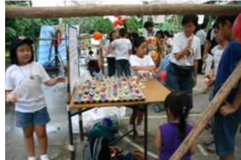
Rainbow Colour Egg Boxes

Food were plenty and sold fast. The GFI moms cooked up a storm, totalling 15 food booths and the verdict—yummy!